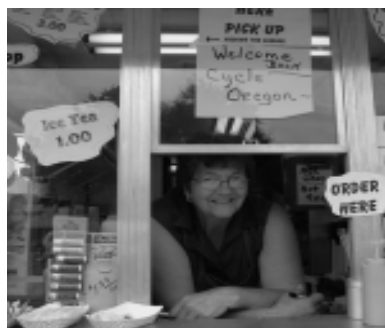
When the locals say "Welcome, Cycle Oregon," they really mean it.