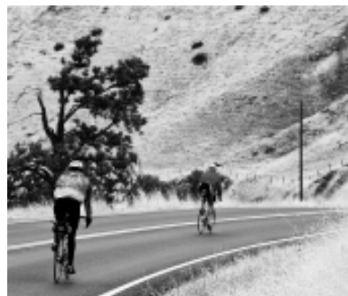
Kinda makes you itchy to hit the road right now, doesn't it...