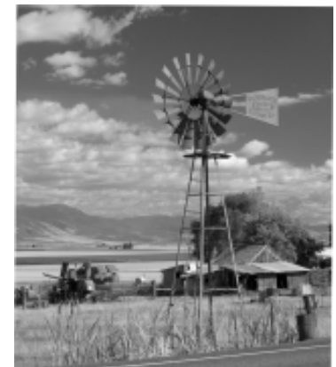
Yes, this is the Wild Wheeled West.

When you’re taking on a week’s worth of pedaling, might be a good idea to ease into it. Today’s ride is just what the doctor ordered: a great introduction to the wild country we’re going to be spending time in, and not too much to bite off on Day 1.