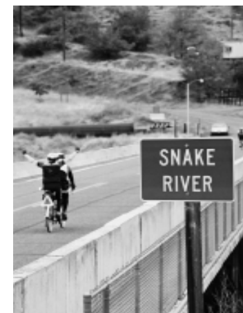
Cycle Oregon goes to Idaho.