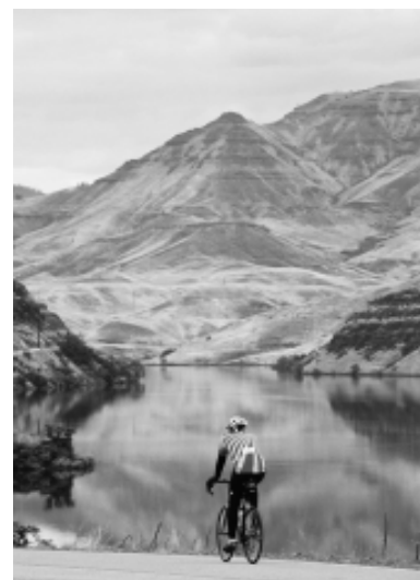
It's hard, but try to keep your eyes on the road.