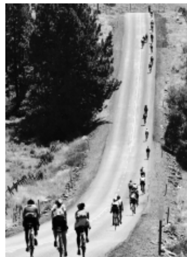
On CO you won't be first and you won't be last... so enjoy the ride.