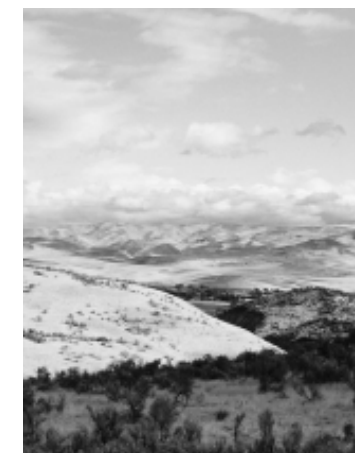
As the early settlers said, "All the scenery you can eat."