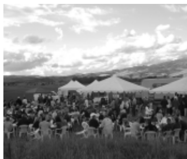
There's nothing like primitive camping in the great outdoors.