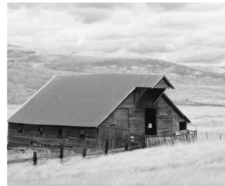
Sky, hills, grass, barn... pedal, eat, drink, schmooze... You have a life and responsibilities back home? Really?