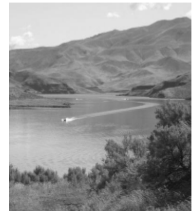
There are canyons, and then there are canyons.

There's one small and fairly steep climb that you'll get to experience from both directions; it's about a mile and a half and goes up about 400