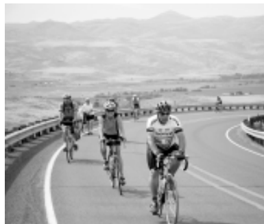
The best part is looking down on where you started the climb.