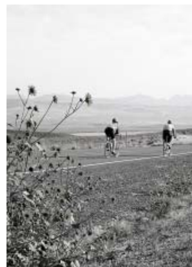
"Great view... do we really have to go over that horizon later?"