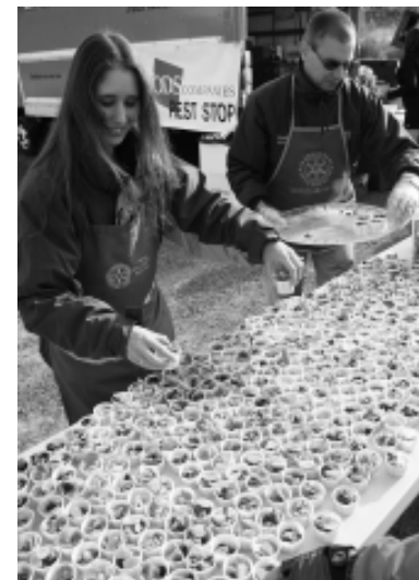
"Little cups. I've got lots of little cups."