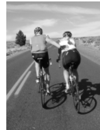
Teamwork is a beautiful thing.