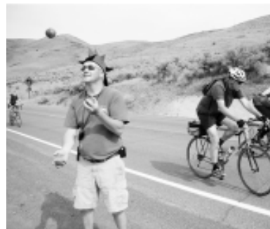
Roadside entertainment at its finest.