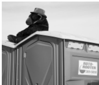
There's a story here, but we're not sure we want the details.