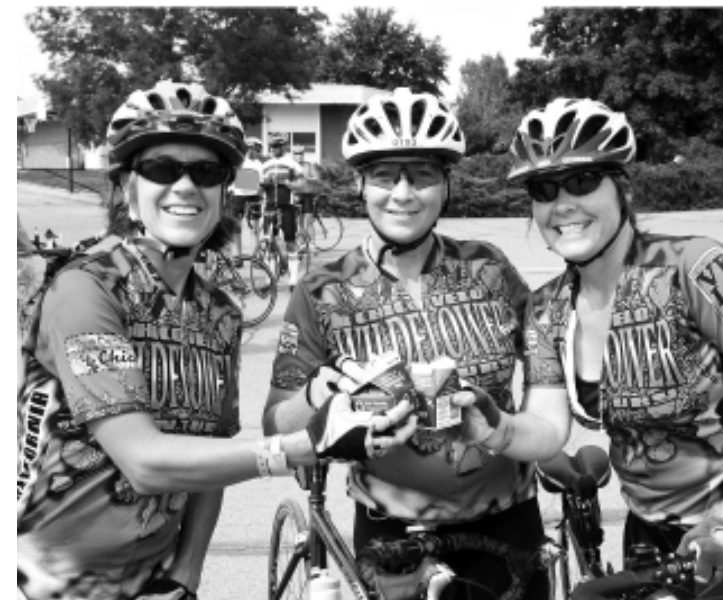
"Let's get together for a drink after the ride..."