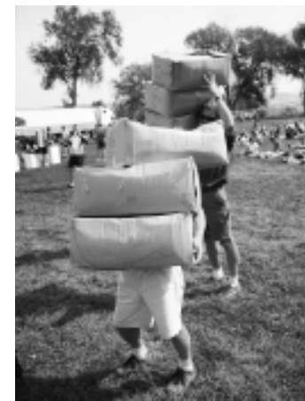
"Juggling? Yeah, you wanna see some good juggling..."