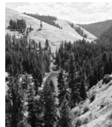
Had enough scenery? Could you stand some more today?

How do you cap off a week as naturally scenic as this one? How about let’s once more skirt one of the most picturesque lakes in America, then roll through fertile valleys, then follow a wild and beautiful river downhill for about 30 miles, including nine miles of river gorge that might rival anything you’ve seen this week.