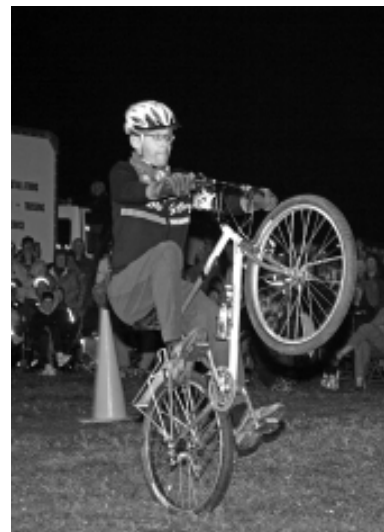
When you own the stores, you'd better be good...