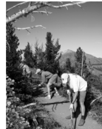
Some hung out in beer gardens, some worked on trails.