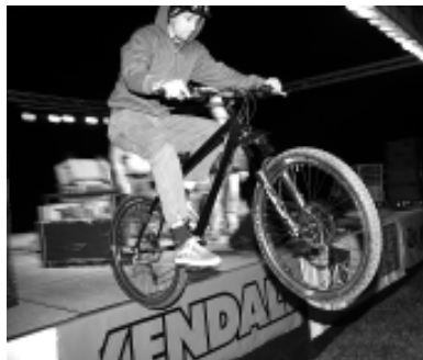
These guys have mad skillz. Do NOT try this on stage at home...