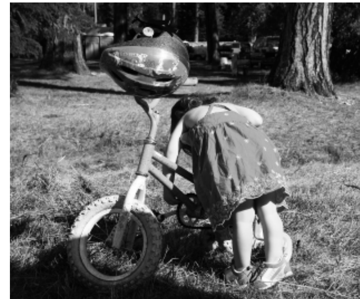
Don't look now, but the next generation of Cycle Oregon riders is coming up behind you, fast.