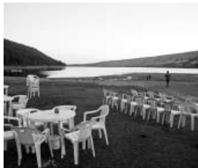
There's nothing like primitive camping in the great outdoors.