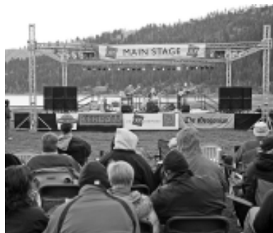
A fresh-air concert setting you won't soon forget.