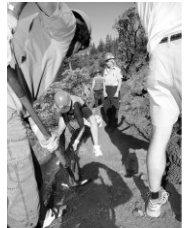
These great volunteers only look like they're on a chain gang.