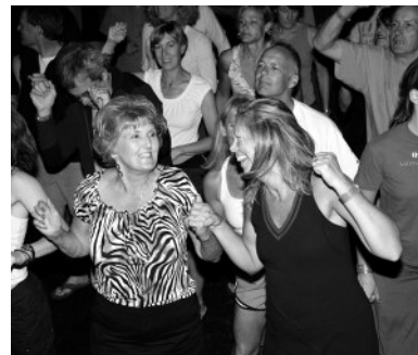
And, people, this show isn't done rocking until she is.