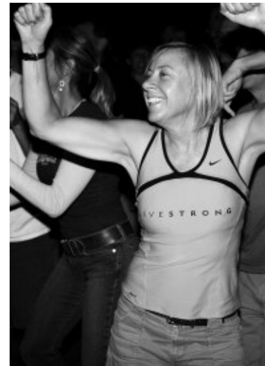
If you don't want to sing karaoke, you sure can dance to it.