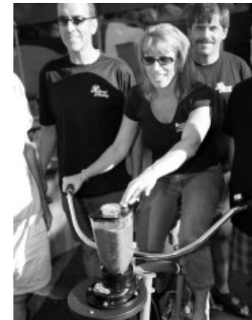
Green and good... the cycling-powered smoothie.