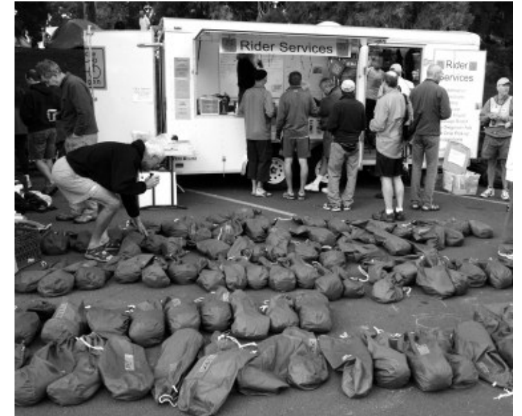
You know, they say a ewe can find her lamb out of a herd of thousands in just a few seconds...