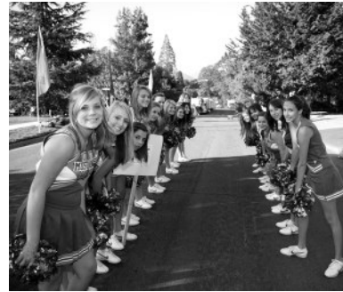
There are welcoming groups, and then there are cheerleaders.