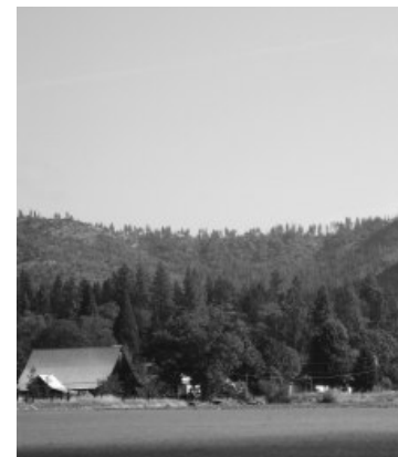
The Applegate Valley--gorgeous in the pioneer days and now.