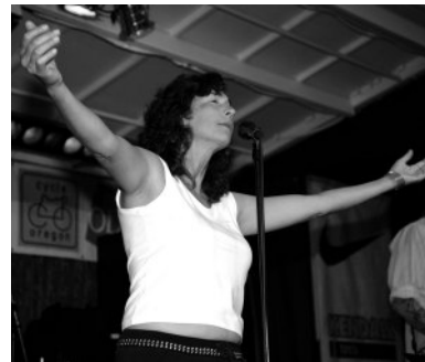
There's nothing like live karaoke to let out your inner Patsy Cline.