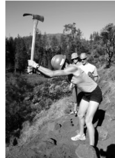
You gotta love a woman who knows how to handle a Pulaski.